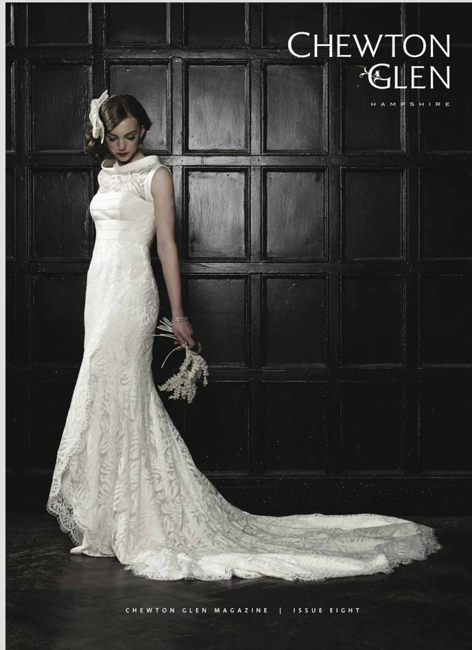
01 CG MAGAZINE FRONT COVER.jpg